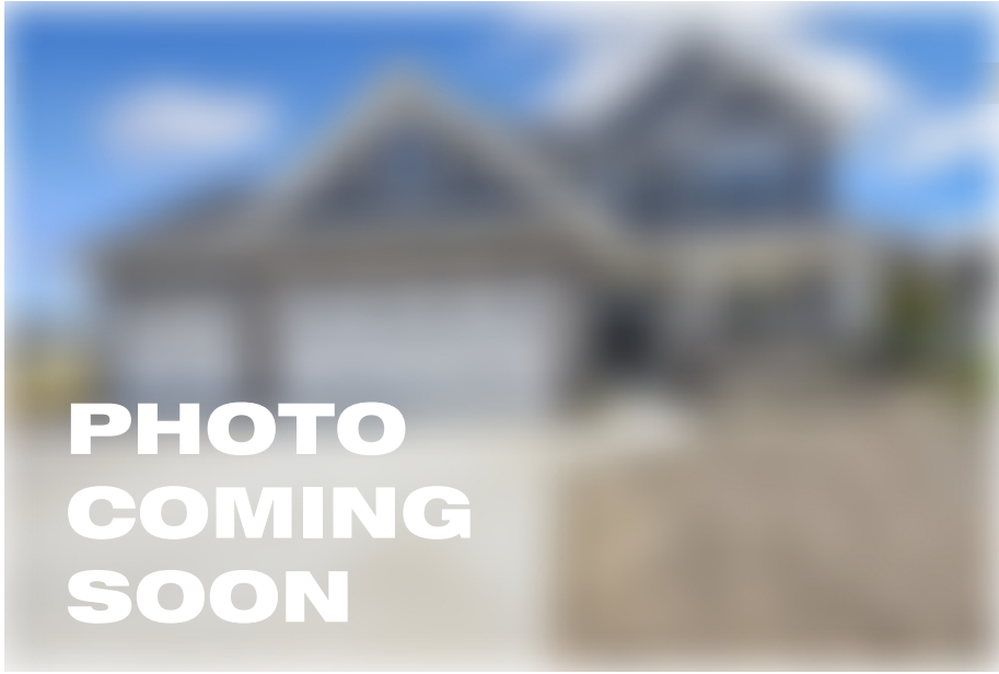
PHOTO COMING SOON